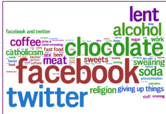
What's your vision of Lent?

• The early Christian Church mirrored the Old Testament and