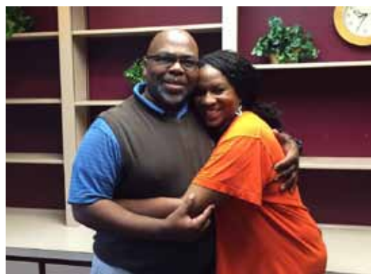
Remember, all are welcome. Y'all come, ya'hear?