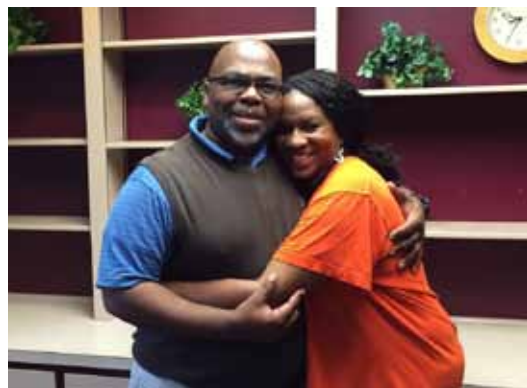
Remember, all are welcome. Y'all come, ya'hear?