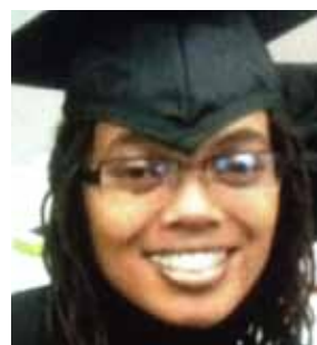
I enjoy interacting with people and watching God transform lives.