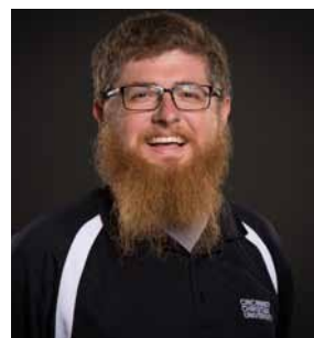
He is newly married, and very excitedly awaits the company of a daughter this upcoming fall.