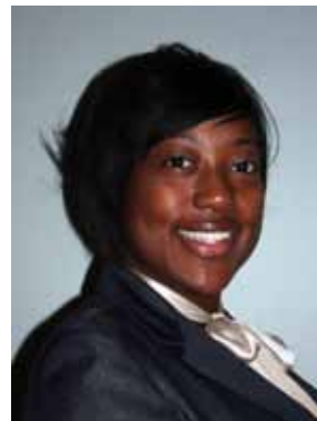
God's purpose and plan for her life.

The Counseling Ministry continues to thrive with individuals, couples and families seeking emotional, mental and spiritual healing. The center is blessed to have lay listeners, graduate counseling student interns and professional counselors walking with people through life's challenges. The ministry provides an important role in people's spiritual growth and transformation as they work through the wounds of life.