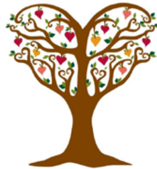
Feast of Love