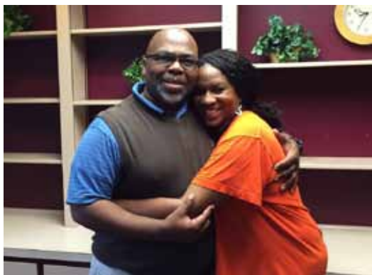
Remember, all are welcome. Y'all come, ya'hear?