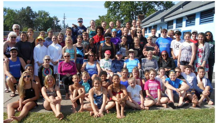
Part of the CHPC 2017 Swim Ministry Staff